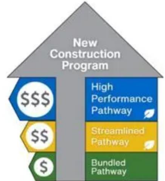
Pathways for Higher Savings